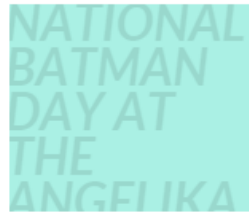
National Batman Day at the Angelika