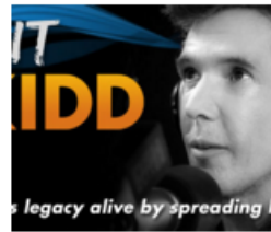
Do It #ForKidd