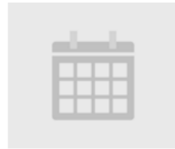
The 8.0 Stage Music Series at Flying Saucer