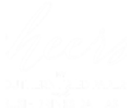
Noble Rey Brewing Company