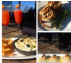
V-Day at Henry's Majestic